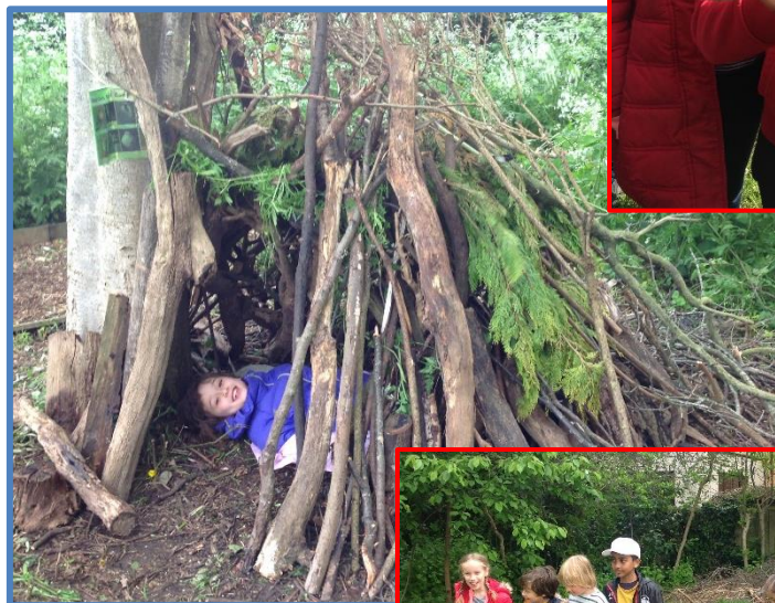
Year 4 Forest School

School. Our thanks special part of our and then prepared to join in for one of delicious!